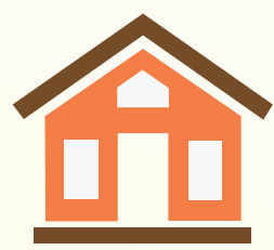
Houses with little to no AC