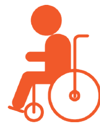
People with disabilities