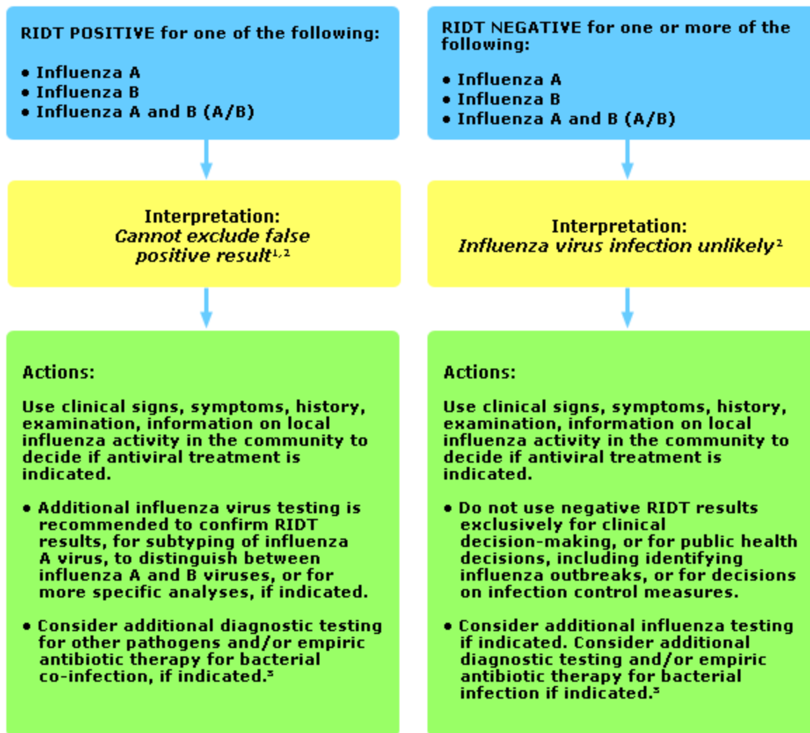
Figure 4: Algorithm to assist in the interpretation of RIDT results and clinical decision-making during periods when influenza viruses are not circulating or influenza activity is low in the community 1

In Figure 4, if the RIDT is POSITIVE for one of the following: Influenza A, Influenza B, or Influenza A and B (A/B) then the interpretation is Cannot exclude false positive result . 1,2 Actions are to use clinical signs, symptoms, history, examination, information on local influenza activity in the community to decide if antiviral treatment is indicated. Additional influenza virus testing is recommended to confirm RIDT results, for subtyping of influenza A virus, to distinguish between influenza A and B viruses, or for more specific analyses, if indicated. Consider additional diagnostic testing for other pathogens and/or empiric antibiotic therapy for bacterial co-infection, if indicated 3 .