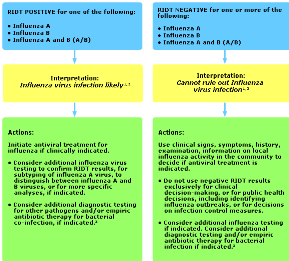
Figure 3: Algorithm to assist in the interpretation of RIDT results and clinical decision-making during periods when influenza viruses are circulating in the community 1

In Figure 3, if the RIDT is POSITIVE for one of the following: Influenza A, Influenza B, or Influenza A and B (A/B) then the interpretation is Influenza virus infection likely . 1,2 Actions are to initiate antiviral treatment for influenza if clinically indicated. Consider additional influenza virus testing to confirm RIDT results, for subtyping of influenza A virus, to distinguish between influenza A and B viruses, or for more specific analyses, if indicated. Consider additional diagnostic testing for other pathogens and/or empiric antibiotic therapy for bacterial co-infection, if indicated. 3