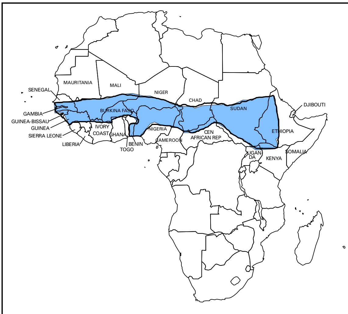
FIGURE 2. Sub-Saharan meningitis belt

Vaccination with the quadrivalent vaccine may benefit travelers to and U.S. citizens residing in countries in which N. meningitidis is hyperendemic or epidemic, particularly if contact with the local populace will be prolonged. Single-dose vials of the quadrivalent vaccine are now available and may be more convenient than multidose vials for use in international health clinics for travelers (30). Epidemics of meningococcal disease are recurrent in that part of sub-Saharan Africa known as the "meningitis belt," which extends from Senegal in the west to Ethiopia in the east (Figure 2) (31). Epidemics in the meningitis belt usually occur during the dry season (i.e., from December to June); thus, vaccination is recommended for travelers visiting this region during that time. Epidemics occasionally are identified in other parts of the world and recently have occurred in Saudi Arabia (during a Haj pilgrimage), Kenya, Tanzania, Burundi, and Mongolia. Information concerning geographic areas for which vaccination is recommended can be obtained from international health clinics for travelers, state health departments, and CDC (telephone: [404] 332-4559).