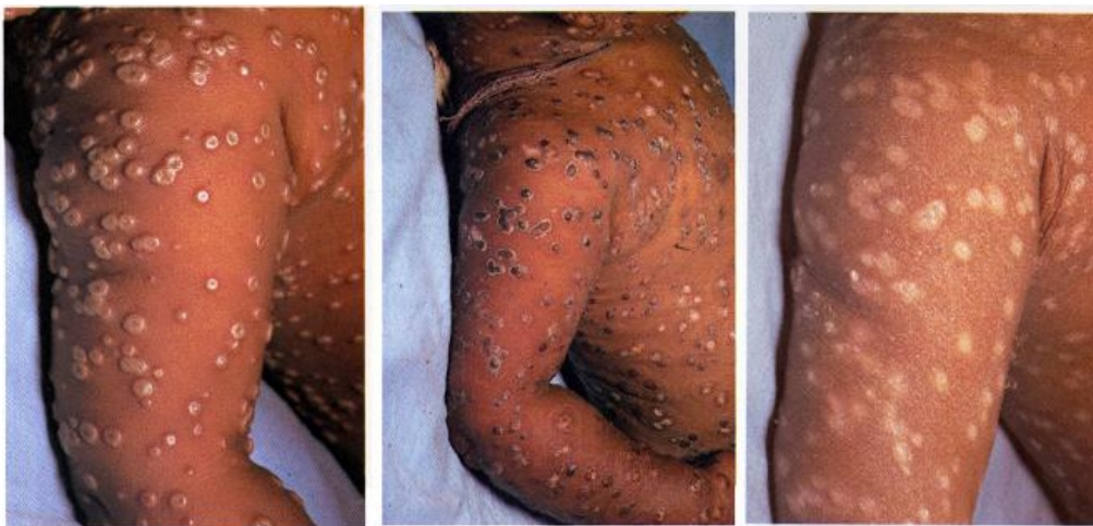
FIGURE 2. Progression of smallpox lesions from, left to right, pustules to scabs to scars