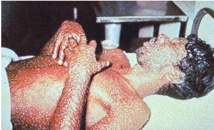
FIGURE 1. Man with smallpox