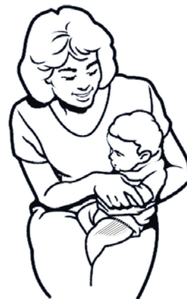
FIGURE 2. Intramuscular/subcutaneous site of administration: anterolateral thigh

Adapted from Minnesota Department of Health