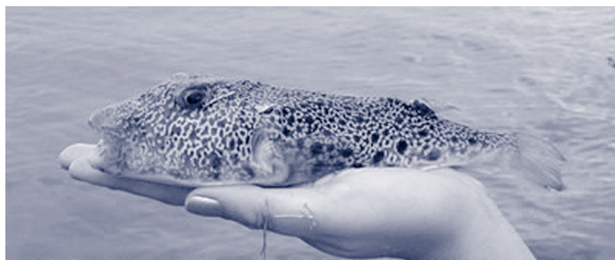
FIGURE 1. A southern pufferfish ( Sphoeroides nephelus )