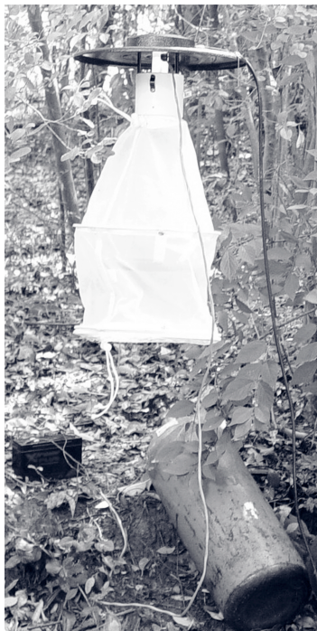
FIGURE. CDC light trap used during investigation to capture Anopheles sp. mosquitoes