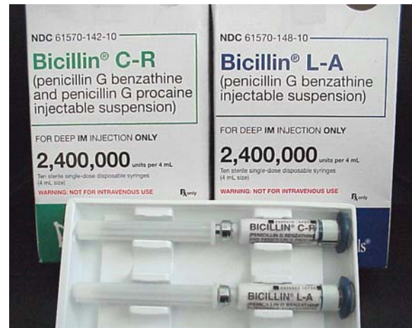
FIGURE. Labeling of Bicillin® C-R and Bicillin® L-A products before changes implemented in 2004