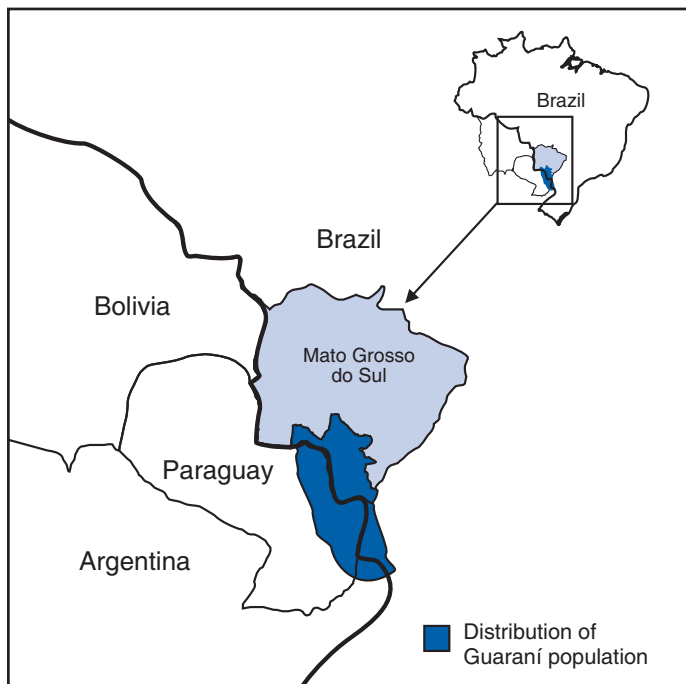
FIGURE 1. Geographic distribution of Guaraní population — Mato Grosso do Sul, Brazil, Argentina, and Paraguay

Participants in the study were from the Kaiowá and Nandeva communities of the Guaraní population, collectively referred to as Guaraní in this report. FUNASA medical teams determined cause of death using categories from the International Classification of Diseases and Related Health Problems, Tenth Revision (ICD-10) (3). Suicide was defined as a death resulting from purposely self-inflicted poisoning or injury corresponding to ICD-10 codes X60–X84 and Y87. Demographic data on Guaraní were drawn from routinely updated census information such as name, sex, date of birth, ethnicity, address, village, Special Indigenous Sanitary District (DSEI), and municipality. As part of an ongoing ethnographic study, an anthropologist obtained qualitative information on each death through interviews with persons who included political and spiritual leaders of the communities. Participants were asked questions about the decedent (e.g., observations of decedent's behavior) and the community (e.g., social or environmental conditions that might have been associated with the suicide). Among the Guaraní in 2000, information on age was available for all but seven cases of suicide, and information on sex was available for all but one case. Demographic data for deaths in other years were complete. Crude rates and age- and sex-specific rates were calculated per 100,000 population.