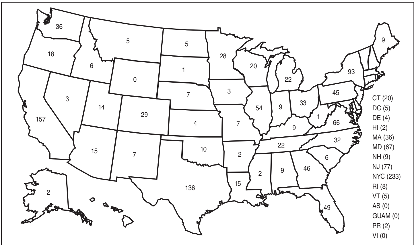
FIGURE 1. Number of malaria cases,* by state in which the disease was diagnosed — United States, 2007