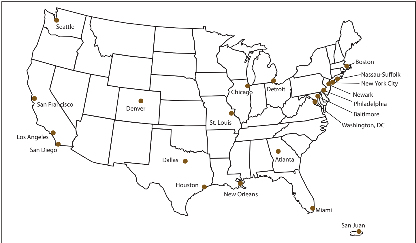
FIGURE 1. Participating metropolitan statistical areas — National HIV Behavioral Surveillance System: heterosexuals at increased risk for HIV infection, 21 U.S. cities, 2010

the estimated rates of HIV diagnoses are relatively low among persons aged >60 years (1). Low SES was not an eligibility criterion but was used in the sampling strategy as described in the following section.