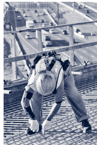
FIGURE 3. Construction worker being evaluated by engineers for musculoskeletal disorder risk factors

Water quality is a public health concern worldwide. CDC engineers at the National Center for Infectious Diseases, working with epidemiologists, have conducted water quality testing, developed standardized chlorine-dosing regimens, and