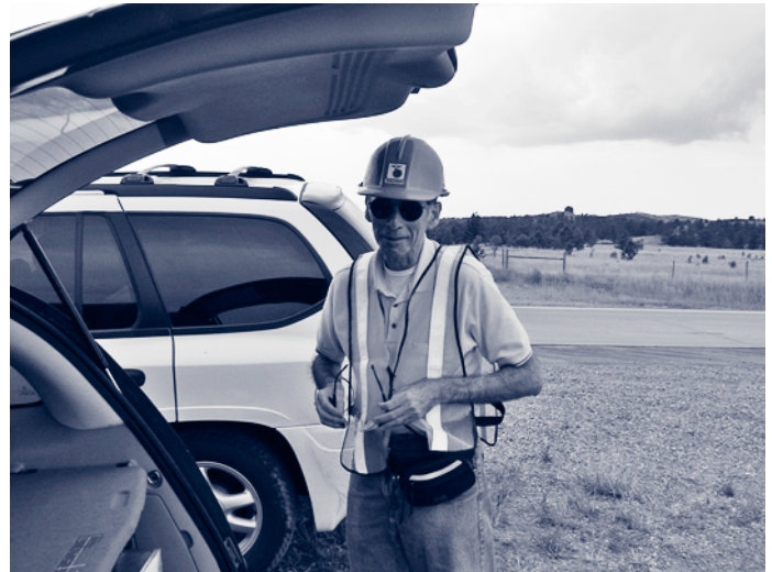
FIGURE 1. Statistician in the field, collecting data for a study on asphalt milling in Rapid City, South Dakota

The integration of statistics and analytic techniques into public health research is a critical asset to the agency (Figure 1) and has resulted in important applications in various disciplines, such as epidemiology, economics, and the behavioral and social sciences. Examples include economic determinations contributing to folic acid supplementation of foods to decrease birth defects (3); behavioral science methods leading to the development of strategies for preventing human immunodeficiency virus infection and acquired immunodeficiency syndrome (4); quantitative epidemiologic analyses leading to understanding the relation between radon and lung cancer in coal miners (5); and evaluations of the effectiveness of using back belts to reduce back injury claims and back pain (6). Other areas of continuing statistical contribution include survey planning and analytic methodology, data-collection