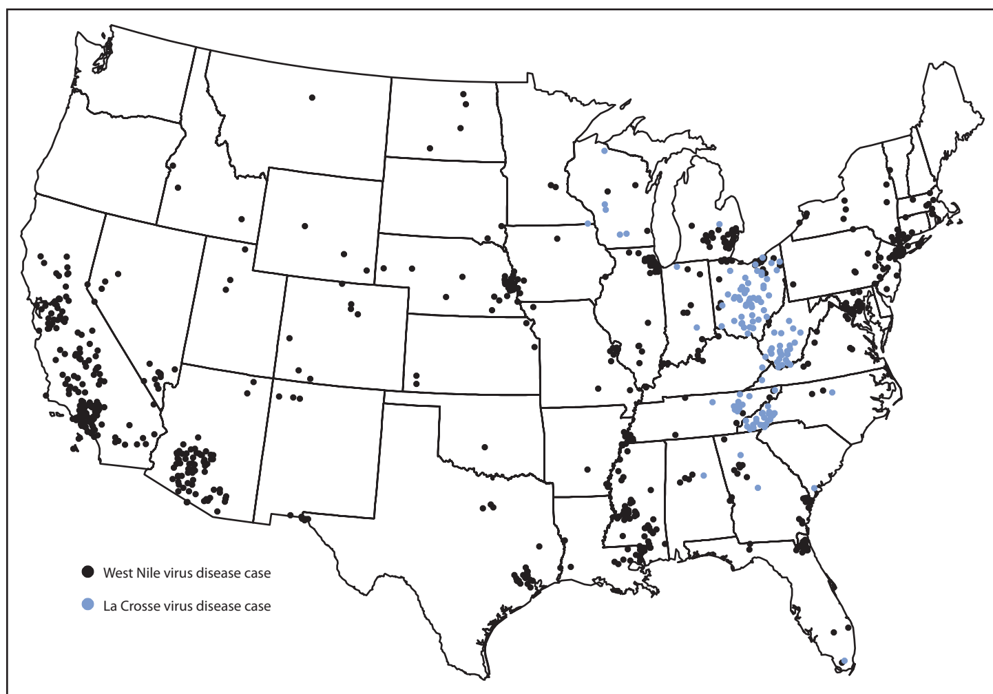
FIGURE. West Nile virus and La Crosse virus disease cases reported to ArboNET, by county of residence — United States, 2011

Therefore, prevention of arboviral disease depends on community and household efforts to reduce vector densities (e.g., applying insecticides and reducing numbers of mosquito breeding sites), personal protective measures to decrease exposure to mosquitoes and ticks (e.g., use of repellents and long-sleeved shirts and long pants), and screening blood donors.