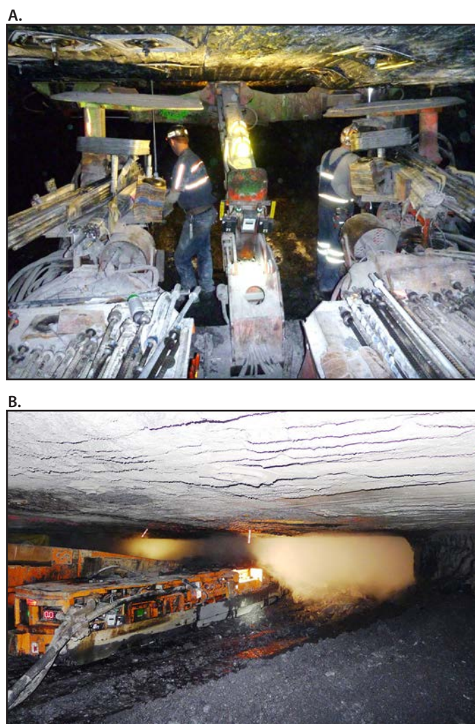
FIGURE 2. Photographs of workers and equipment under typical conditions in an underground coal mine*

* A. Two miners use a roof-bolting machine to install the bolts that support the roof of an underground coal mine. B. A continuous miner machine extracts coal from the mine face with a rotating drum.