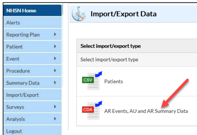
Figure 9 Customized Rights Import/Export Screen

For this level of customized rights, the tabs in the navigation bar show options to add the Reporting Plan, find Events, delete AR Events as well as AU and AR Summary data, and generate data sets and analysis reports for AUR data only. As shown in Figure 9, the user with this level of rights can upload CDA files for the AUR Module only. In addition, they are not able to view data for other modules that are not in their Customized Rights.