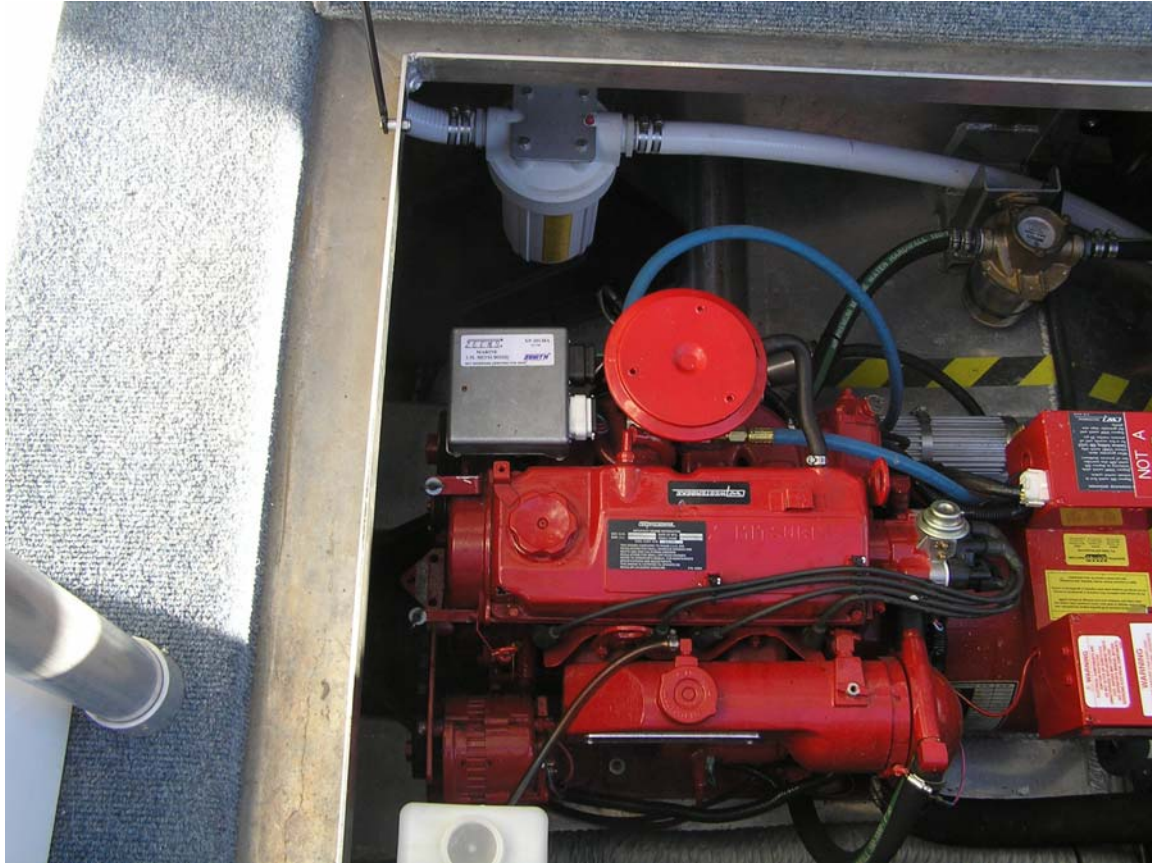
Figure 3. Photo of Westerbeke Generator with Zenith Electronic Fuel Injection kit.