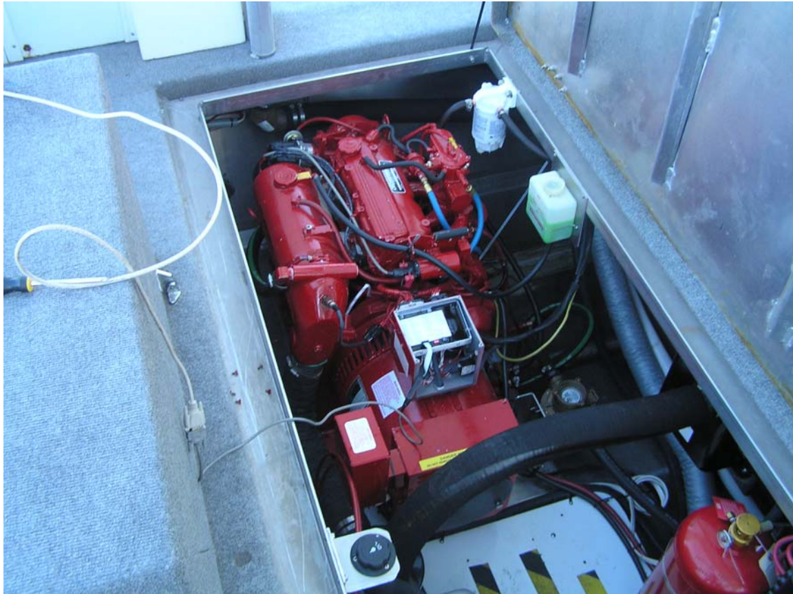
Figure 2. Photo of the Westerbeke Safe CO generator with catalyst.