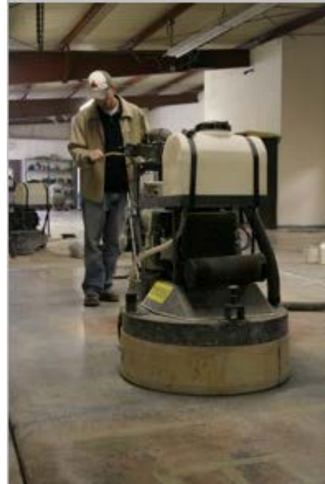
Figure 2: Floor polishing tool with water control

Many walk-behind concrete surfacing tools are sold by the manufacturer with dust controls as original equipment (Figure 2). Other dust controls are offered as after-market options. However, there is little research available that demonstrates that either the original equipment or after-market controls are effective in limiting worker exposures to respirable dust or respirable crystalline silica. Flanagan et al. [2003] reported that seven of nine samples collected during concrete floor sanding exceeded the ACGIH® TLV® for respirable quartz (at that time 0.05 mg/m 3 , identical to the NIOSH REL; however, since then the current TLV® has been reduced to 0.025 mg/m 3 ). The geometric mean and geometric standard deviation for those nine quartz samples were 0.07 mg/m 3 and 2.62 mg/m 3 , respectively. These exposures demonstrate the need to identify effective dust controls for walk-behind concrete surfacing tools to reduce silica exposures among workers using these tools.