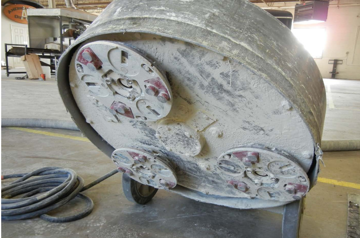
Figure 5: Shroud and polishing disks installed on the Concrete Polisher

When the concrete polisher was operated, the flow induced by the spinning of the polishing tooling caused a large portion of the dust generated to be collected in the periphery of the shroud, where the vacuum ports are located. Figure 5 shows the dust-collecting shroud and the polishing disks installed on the concrete polisher.