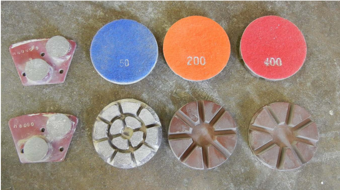
Figure 4: Some of the different grits used during the survey

Two TSI SidePak™ Personal Aerosol Monitors AM510 (TSI Incorporated, Shoreview, MN) mounted on a tripod at breathing zone height (1.5 m) were used to verify that the room was ventilated and cleaned to background respirable dust levels no greater than 0.05 mg/m 3 . Since there are no direct-reading instruments for respirable crystalline silica, using the crystalline silica REL as the respirable dust background level ensures that the background silica concentration will be lower than the NIOSH REL.