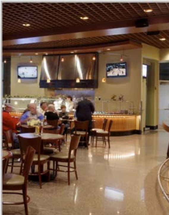
Figure 1: A polished concrete floor

Crystalline silica is a constituent of several materials commonly used in construction, including brick, block, and concrete. Many construction tasks have been associated with overexposure to dust containing crystalline silica [Chisholm 1999, Flanagan et al. 2003, Rappaport et al. 2003, Woskie et al. 2002]. Among these tasks are tuckpointing, concrete cutting, concrete grinding, abrasive blasting, and road milling [Nash and Williams 2000, Thorpe et al. 1999, Akbar-Khanzadeh and Brillhart 2002, Glindmeyer and Hammad 1988, Linch 2002, Rappaport et al. 2003]. Colored, stained, and polished concrete floors are increasingly popular for use in homes, offices, retail establishments, schools, and other commercial and industrial settings. For example, a major chain store has specified integrally-colored concrete floors in its new stores in place of vinyl composite tile. Polished concrete floors are durable, sanitary, and easy to maintain (Figure 1).